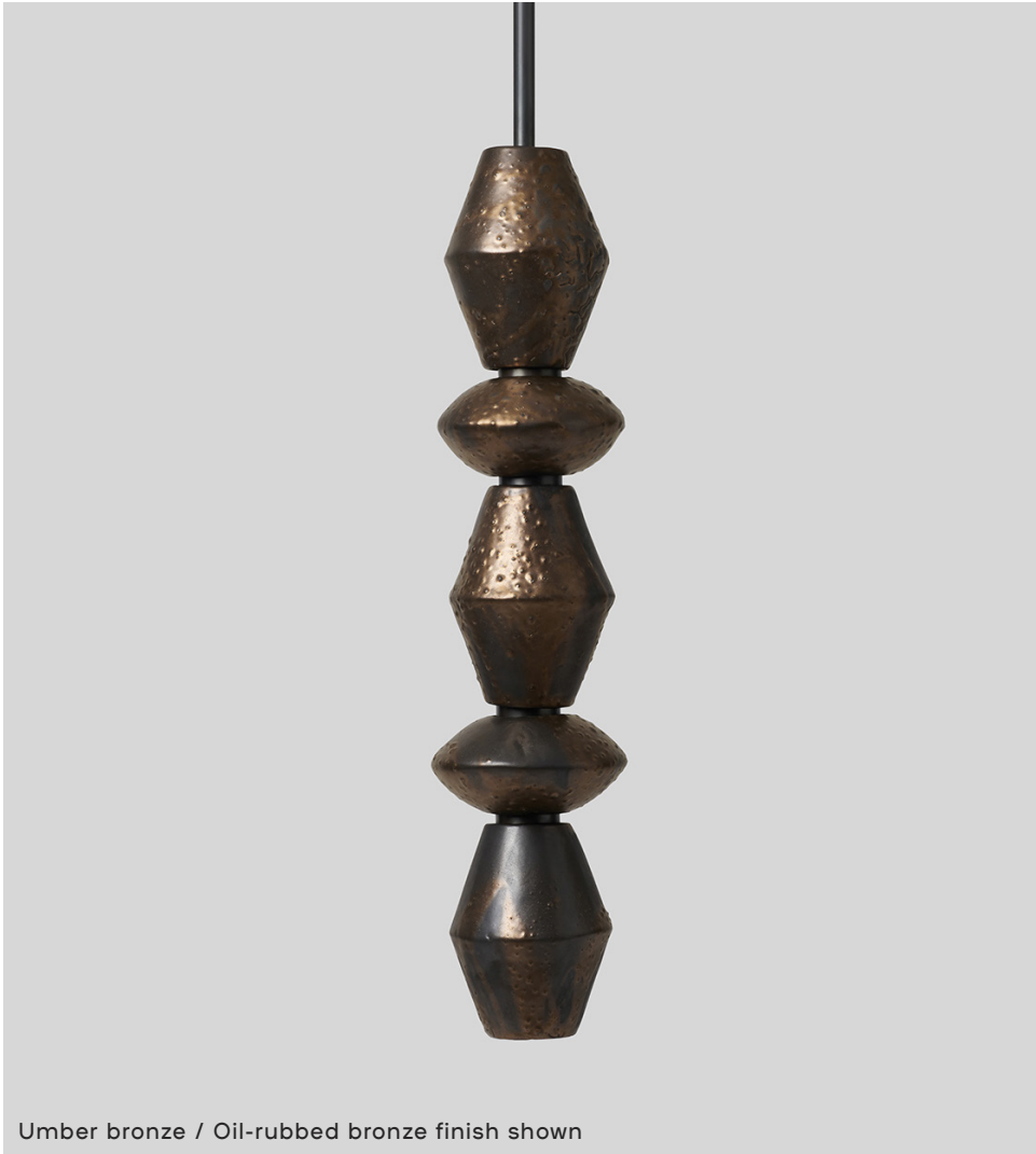
Umber bronze / Oil-rubbed bronze finish shown